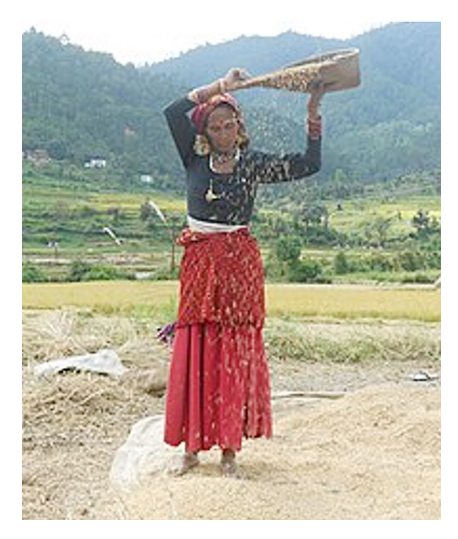
Fig. 4: Winnow sorting practice.

There needs to be more information about the efficient performance of winnow sorting, especially in AF removal in groundnut and percentage loss in commonly used sub-Saharan African countries. Theoretically, the help of wind winnowing can remove smaller and lighter groundnuts generally found to contain a higher concentration of AF.