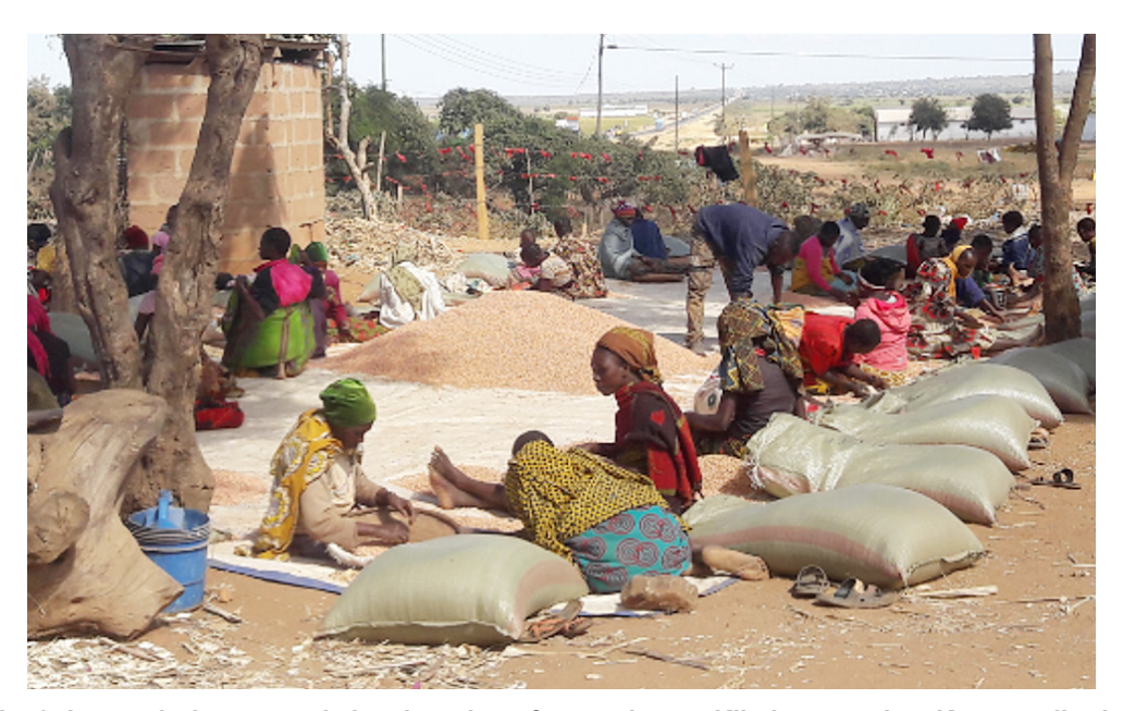
Fig. 2: Image during manual visual sorting of groundnut at Kibaigwa market, Kongwa district, Tanzania. Graders were given a bag of 100kg each to sort to remove rotten and molded groundnut before getting to the market

Careful sorting of raw kernels before consumption or making a product is essential to minimize the risk of AF contamination. This suggests that training before sorting is necessary for AF reduction, as witnessed by Xu et al. Further investigation may provide more information on the efficient complementation of multiple sorting methods like size /screening, winnowing, dehulling, and density sorting, which are faster but still cost-effective.