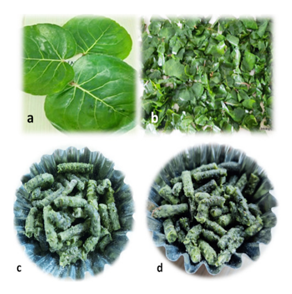
Fig.1. Fresh (a) and boiled (b) N. scutellarius leaves, and pellets of a standard diet containing fresh (c) and boiled (d) N. scutellarius

N. scutellarius follows the same procedure (Fig.1d). The percentage of N. scutellarius , i.e., one-third of daily diet intake, was compose based on the My Plate (Piringku) guide from the Indonesian Ministry of Health for a healthy diet.