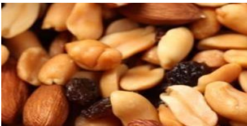
Figure 3: Legend for figure 3

The Discussion should state the possibilities the results uncover, that need to be further explored. Results and discussion of results can also be combined under one heading, Results and Discussion.