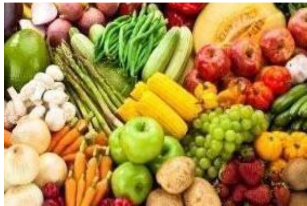
Figure 1: Legend for Figure 1 to be typed here